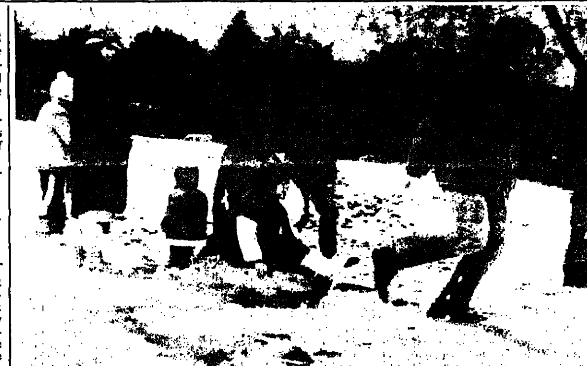
Jerusalemites use makeshift sledges on the slopes of Sacher Park at the weekend as abnormally cold weather hit Israel. More snow was predicted this week in the hilly regions, and flooding was forecast for low-lying areas. Widespread damage to crops was reported as temperatures in Jerusalem plunged to 0 degrees centigrade. In Tel Aviv the thermometer went down to 7, low for the city, and in Eilat to 12, the country's warmest spot.